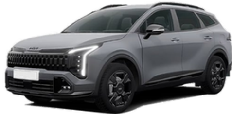
Shadow Matt Grey (HEV only)