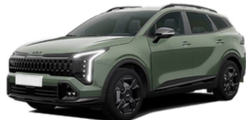
Jungle Wood Green (X-Line only)