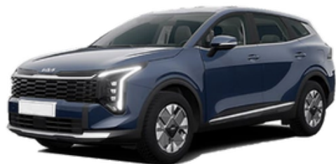
Black Sea Blue