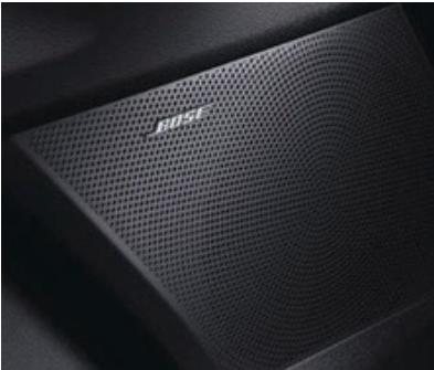
12-Speaker Bose® Premium Sound System (SX Tech Pack only)