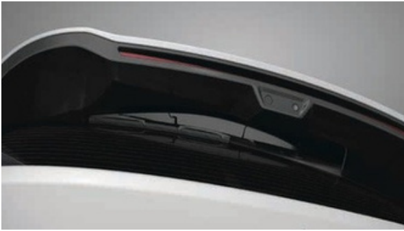
Hidden Rear Wiper