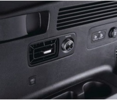
3rd Row Air Conditioning System