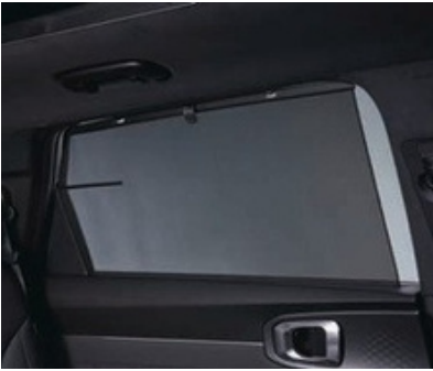
Rear Side-window Sunshades