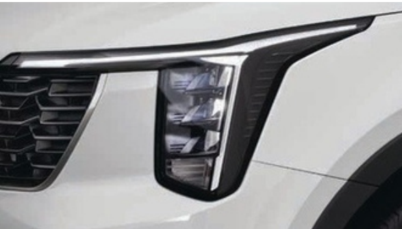
MFR LED Headlamps (SX only)