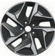
17-inch Alloy Wheel