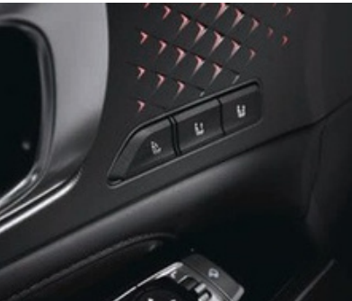
Integrated Memory System (Driver only)