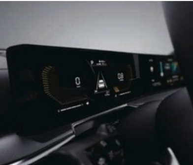
Supervision Cluster (12.3" Colour TFT LCD)