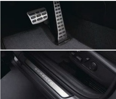
Metal Pedals / Door Scuff