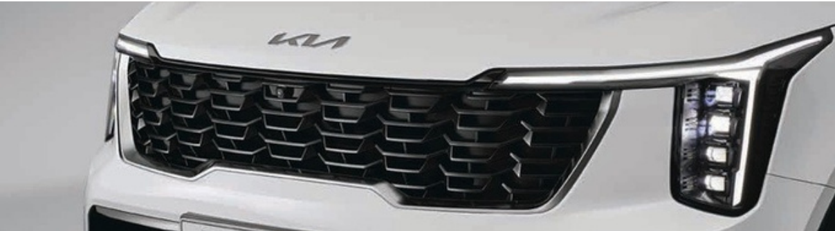
High Gloss Black Radiator Grille