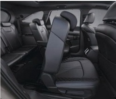
2nd Row One-touch Walk-in System