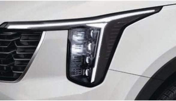
4-Cube Projection LED Headlamps with Sequential Turn Signals (SX Tech Pack Only)